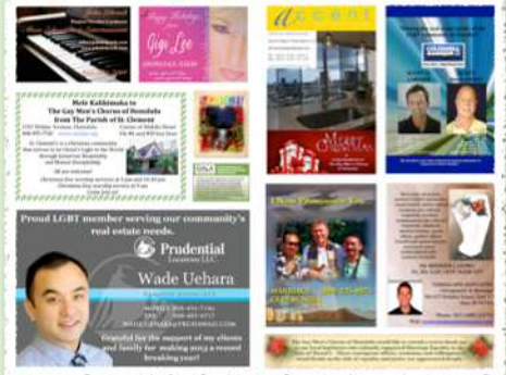
Example to Scale