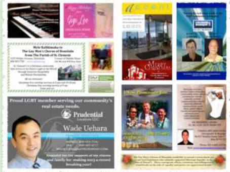
Example to Scale